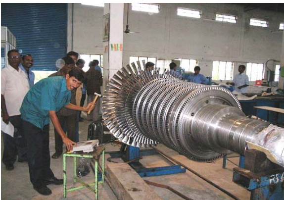
Natural Frequency testing of Blades