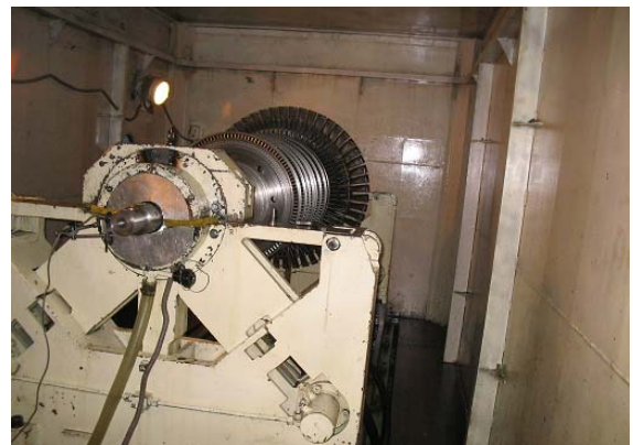
Operating Speed Balancing in Vacuum