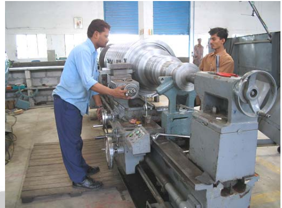
Blade Root Grooves Machining