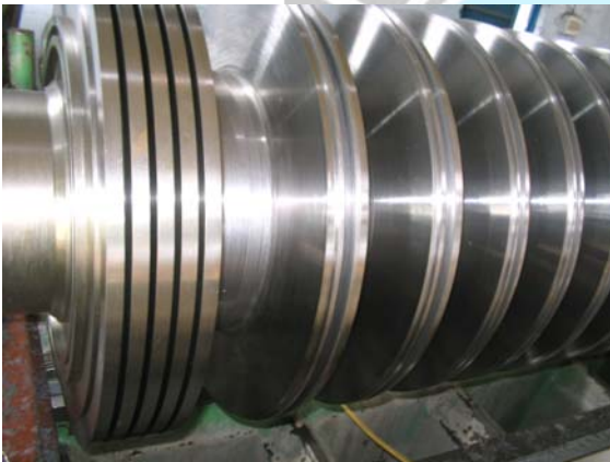
Rotor after Groove Machining