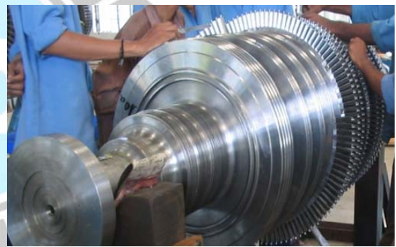
Assembly of the Blades on the Rotor